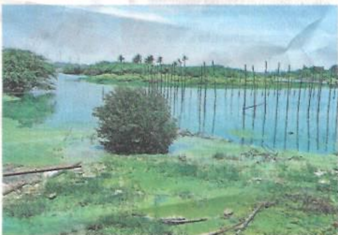
Algal bloom spread across the Muttukadu estuary

The water body is also used for recreational activities. Tamil Nadu Tourism Development Corporation (TTDC) operates a boat house at Muttukadu. Sekhar, a fisherman at Kovalam said fish catch has drastically reduced in the lagoon. He blamed it on industrial and domestic waste discharge. Central Institute of Brackishwater Aquaculture (CIBA), which runs an experimental station using the lagoon, has abandoned activities due to toxic algal bloom.