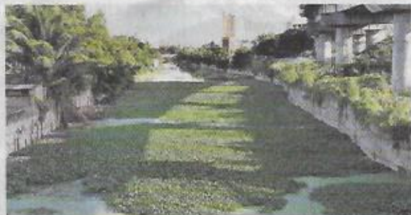
An urban forest will be developed along a 2-km stretch from Madhya Kailash MRTS to Thiruvanmiyur MRTS.

"The detailed project report will be prepared in two months. Urban forest will be developed along a two-km stretch from Madhya Kailash MRTS to Thiruvanmiyur MRTS. We will adopt the Miyawaki technique to create a