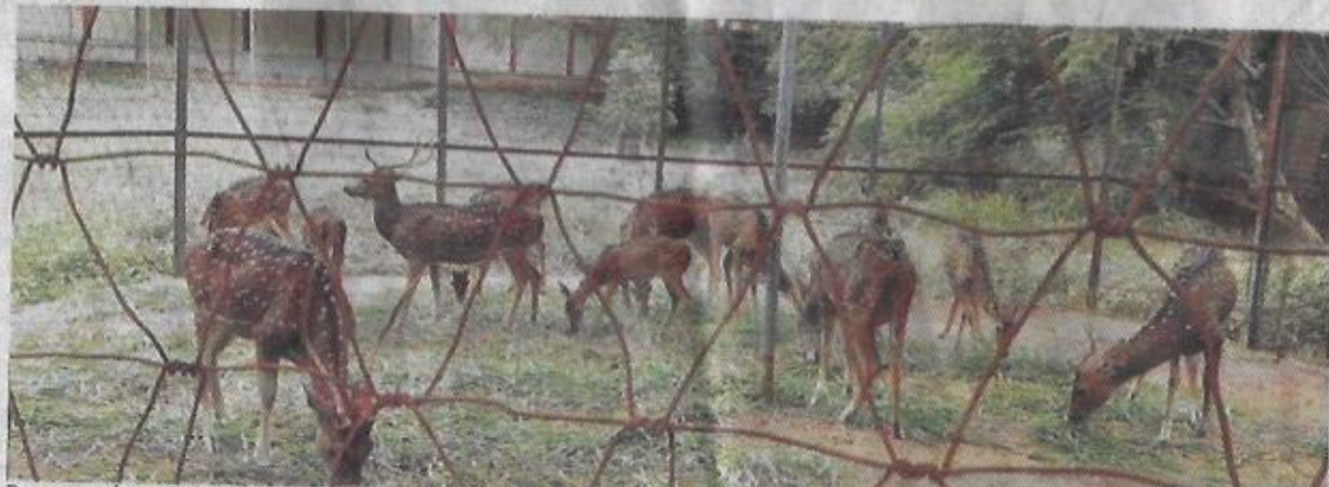
Deer grazing at the Sivaganga park in Thanjavur, Which is to be restructured under smart city programme.

Sivaganga park, the main tourist attraction, particularly for school children, had a mini zoo with animals like fox, rabbits, deer and even camel. A proposal